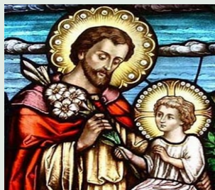
St Joseph - Pray for us